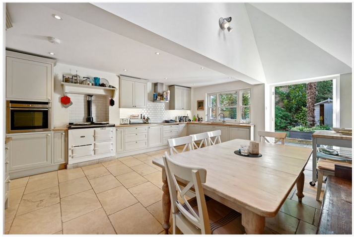
PERCY ROAD, LONDON, W12 £1,475,000 FREEHOLD