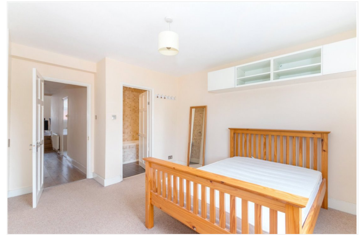
LOUISVILLE ROAD, SW17 £575,000