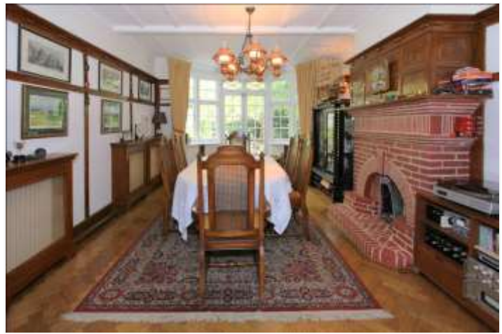
HEATHFIELD GARDENS, BRENT CROSS, LONDON, NW11 £1,150,000 FREEHOLD