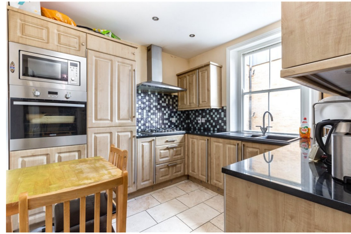
CHESHIRE STREET, LONDON, E2 £1,650,000 FREEHOLD