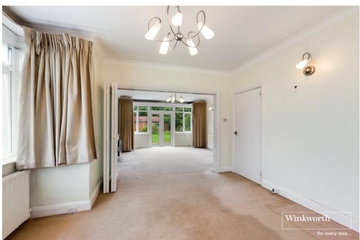
DONNINGTON ROAD, HARROW, HA3 £950,000 FREEHOLD