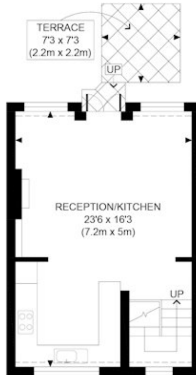
THIRD FLOOR GROSS INTERNAL FLOOR AREA 377 SQ FT

This floorplan is for illustration purposes only and is not to scale. The position and size of doors, windows, appliances and other features are approximate.