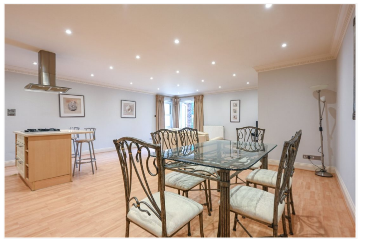
OATLANDS DRIVE, WEYBRIDGE SURREY, KT13 £575,000 SHARE OF FREEHOLD