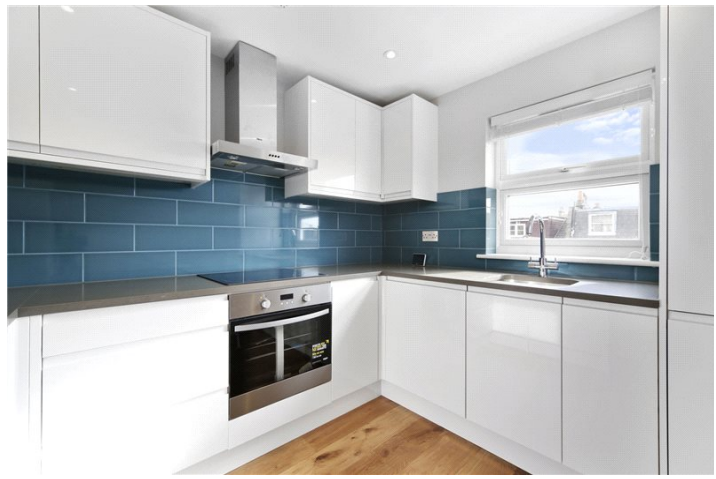
LOFTUS ROAD, SHEPHERDS BUSH, LONDON, W12 £425 PER WEEK FURNISHED £1,841.67 PER CALENDAR MONTH

A beautifully presented and newly refurbished two double bedroom flat located in the heart of Shepherds Bush. Furnished. Available 8th March 2022.