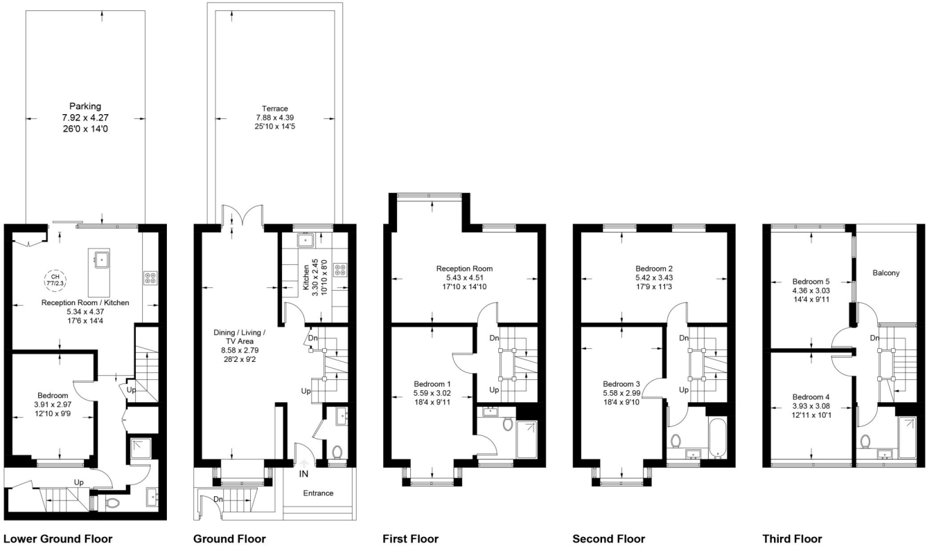
Illustration for identification purposes only, measurements are approximate, not to scale. floorplansUsketch.com © (ID927410)

This floorplan is for illustration purposes only and is not to scale. The position and size of doors, windows, appliances and other features are approximate.