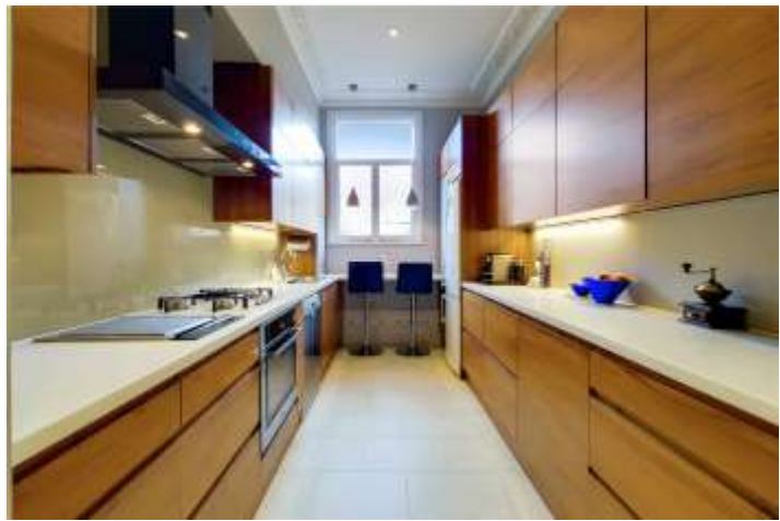
BISHOPSWOOD ROAD, LONDON, N6 OFFERS IN EXCESS OF £1,350,000 SHARE OF FREEHOLD

A TWO-BEDROOM CONVERTED FLAT COMPRISING SOME 1,133 SQ. FT. OF ACCOMMODATION, FORMING PART OF A HANDSOME, DOUBLE-FRONTED VICTORIAN RESIDENCE, BUILT IN RARE GAUNT BRICK AND SET BACK FROM THE ROAD BY ITS OWN DRIVE AND FRONT GARDEN.