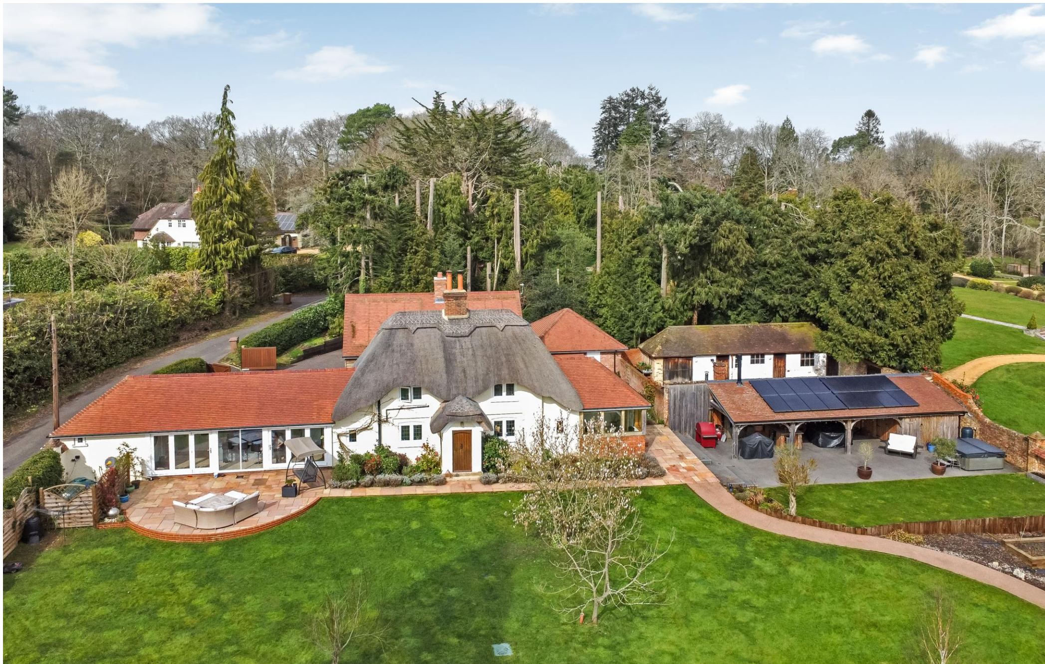
Coombe Cottage, Church Lane, Awbridge, Romsey SO51 0HN