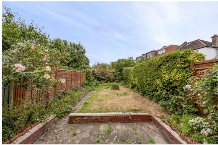
MOYSER ROAD, SW16 £975,000 FREEHOLD

AN EXCITING OPPORTUNITY TO ACQUIRE A LARGE PERIOD FAMILY HOUSE SITUATED IN THE HEART OF FURZEDOWN, OFFERING ENORMOUS POTENTIAL TO CREATE A WONDERFUL FAMILY HOME.